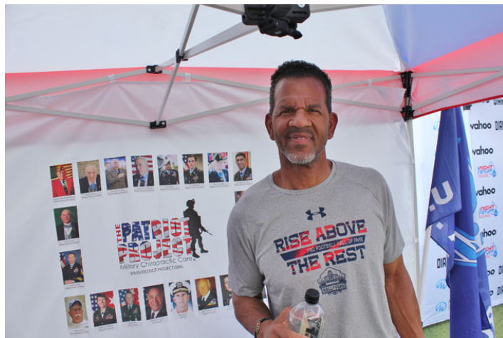
Andre Reed, Wide receiver HoF Class 2014