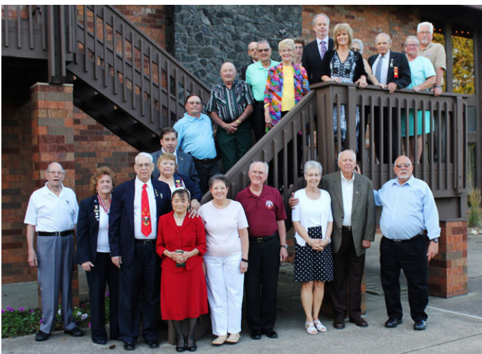
The MSA club and Guests for the September 14, dinner