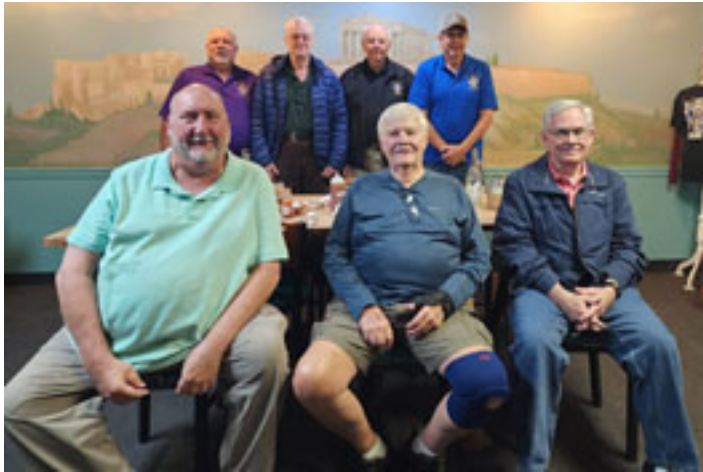
On September 28th seven, 33 degree members had their first 33° club meeting at Athens Restaurant. They have started a 33° club and will meet each month on the 4th Tuesday at Athens. They have invited MSAs to attend also.