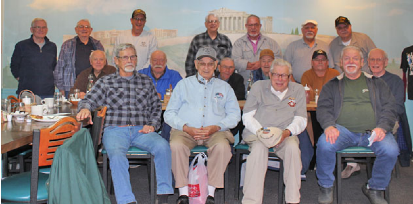
MSA Breakfast October 10, 2023 at Athens Restaurant

You might get your picture in the Chronicle. November 14 December 12