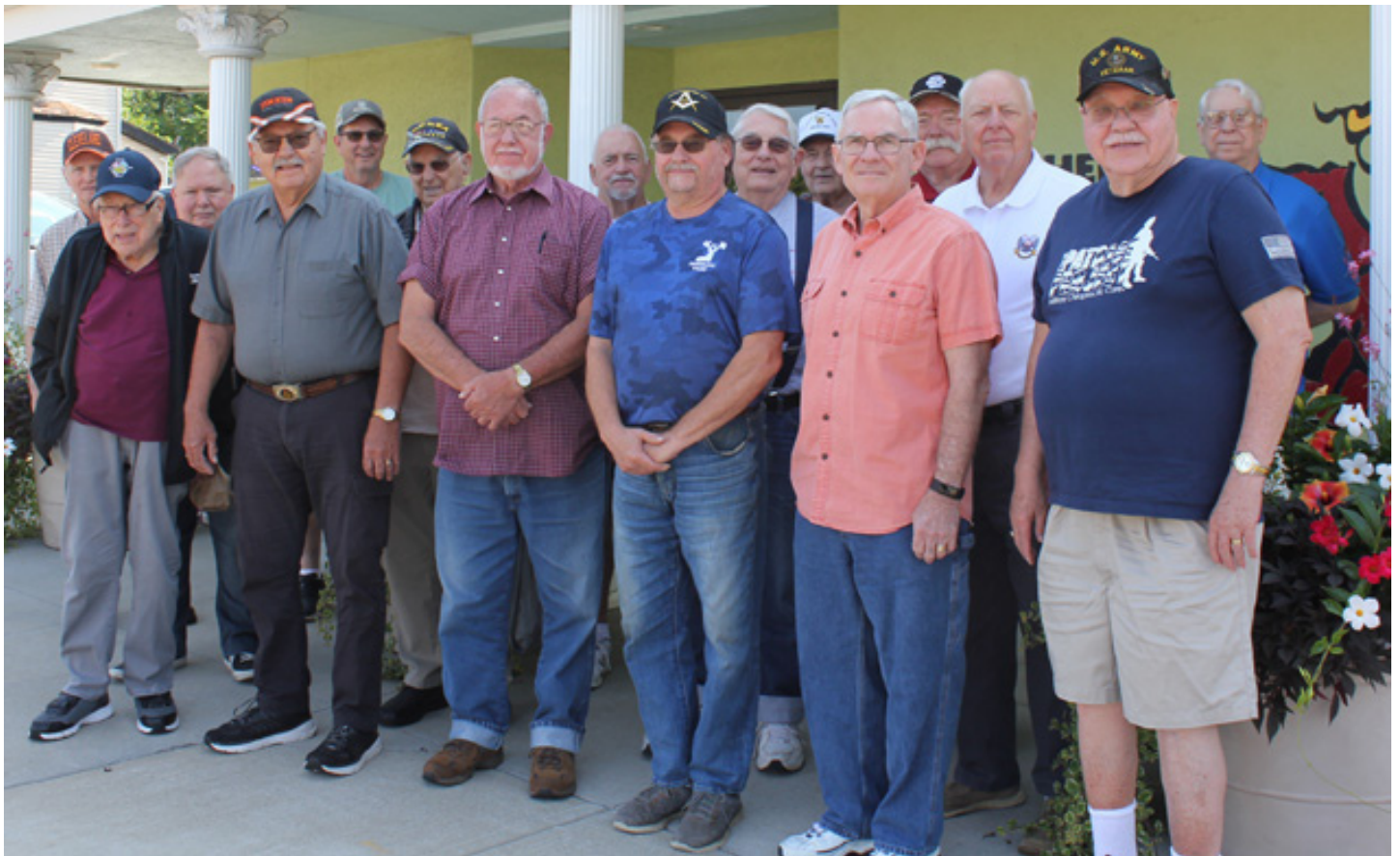
JULY 11, 2023 MSA BREAKFAST