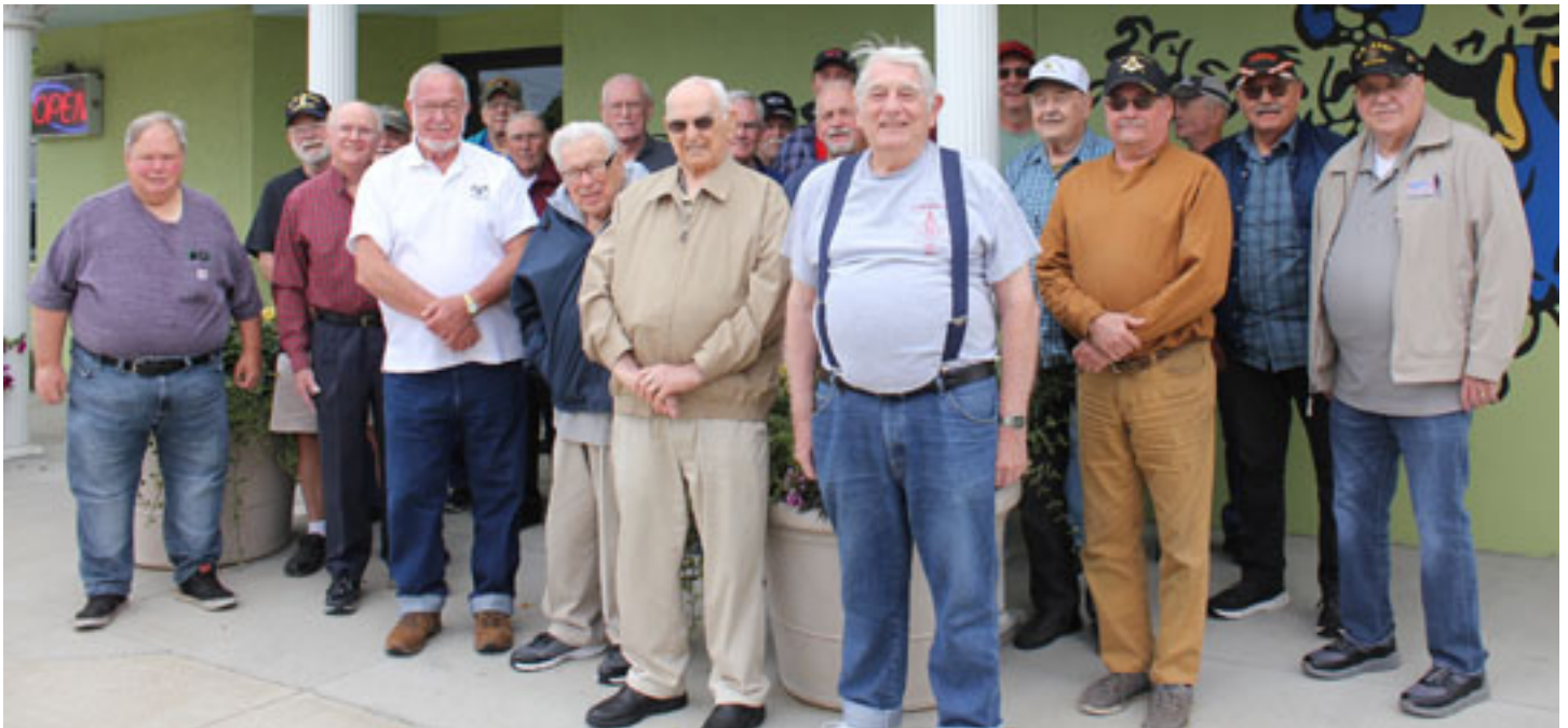
June's MSA Club Breakfast turnout