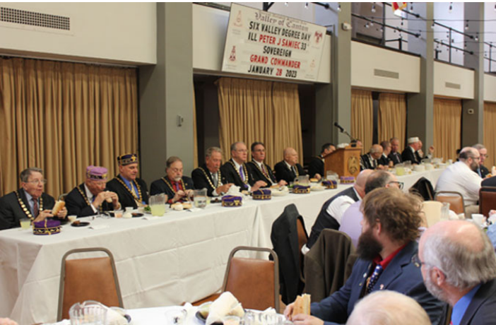
The head VIP table at lunch

National Medal of Honor Day is observed every year on March 25 and is dedicated to Medal of Honor Recipients.