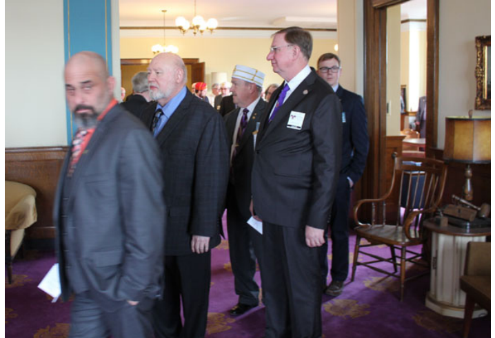
The above two pictures show the line for Brethren to get their Passbooks stamped after viewing a degree