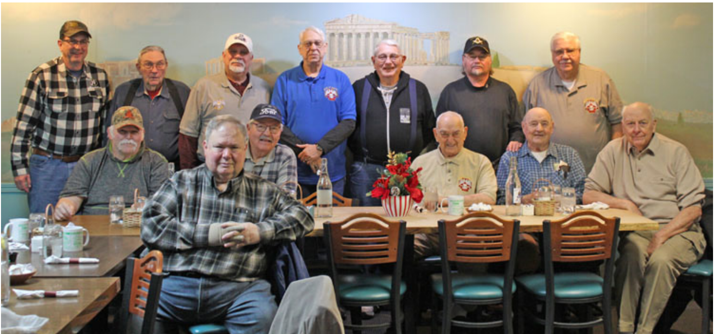
MSA breakfast on February 14, 2023

This is an open invitation to all Brethren to come and join the group for some good fellowship