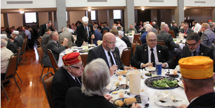
The above two photos show the very large lunch crowd for the Six Valley Degree Day