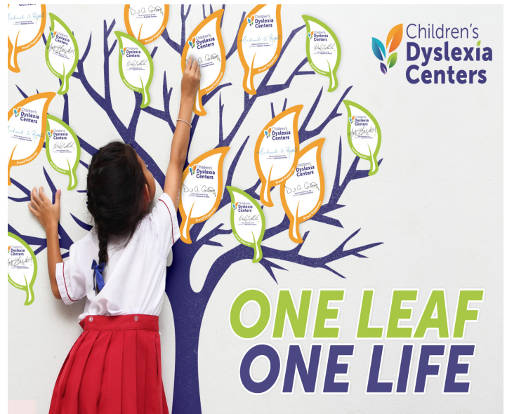
The Tree of Life to be located in the lobby

Before you speak, listen. Before you write, think. Before you spend, earn. Before you criticize, wait. Before you pray, forgive. Before you quit, try. Anonymous