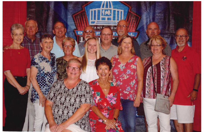
The Valley's 2019 chair numbering crew for the Hall of Fame event this past August

$10 for Green leaves & $20 for Orange Leaves