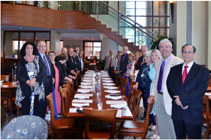
The Valley of Canton 33° and their ladies ready to have a Valley Dinner at Supreme Council.