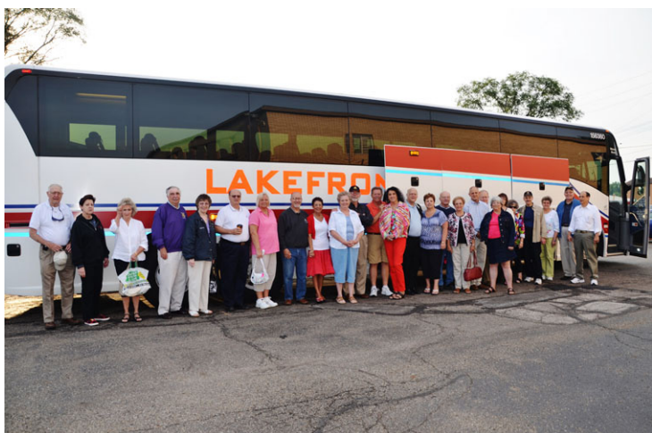
The Akron and Canton contingent ready to travel

To hear more of Amy's job search tips tune in Mondays on WHBC Mix 94.1 FM at 6:40 a.m. or on WJER 1450 AM at 3:15 p.m.