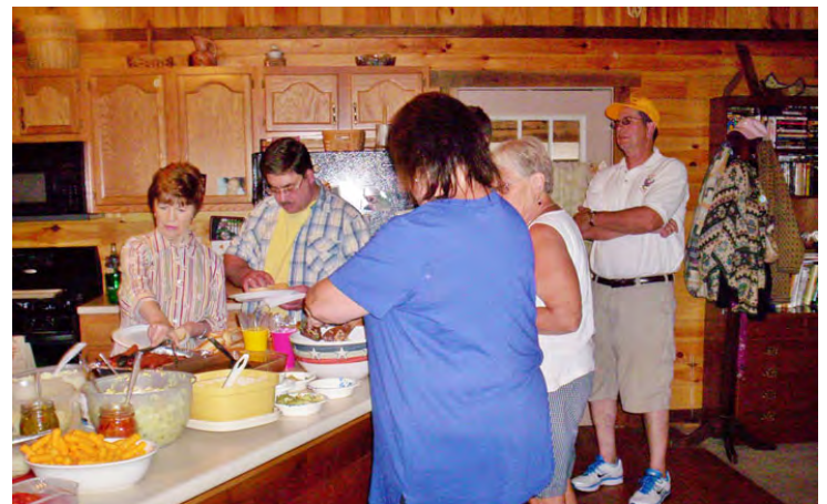
The food bar at the Rose Croix picnic