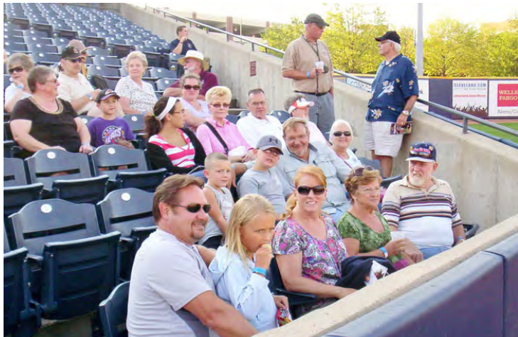
Valley of Canton Scottish Rite families at the Akron Aeros baseball game on Friday July 13th.

To make reservations for dinner, please use the coupon BELOW Please R.S.V.P. By August 5, 2012.