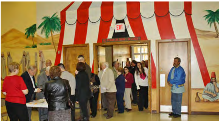
Lining for the tour of S.U.C.I