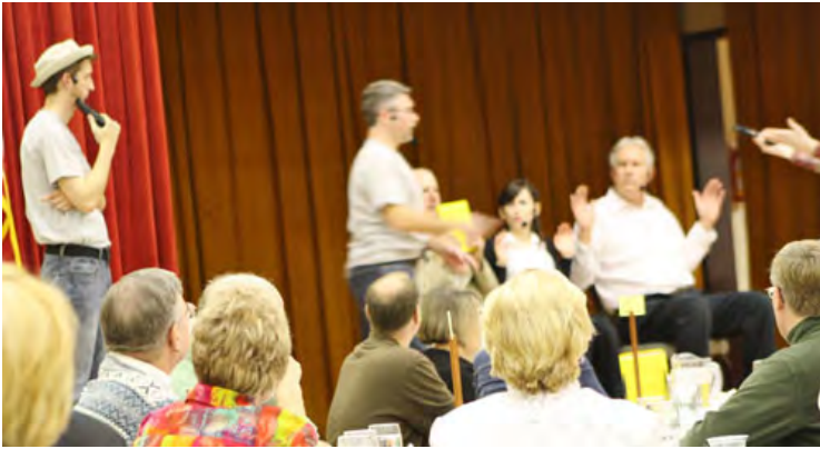
Is this turning into a hostage situation?