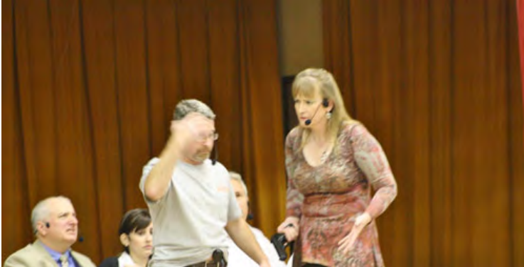
"Slick" and Hattie try to figure out what is going to happen next! We have hostages?