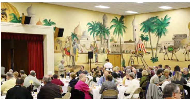
The Executive dining hall of S.U.C.I.