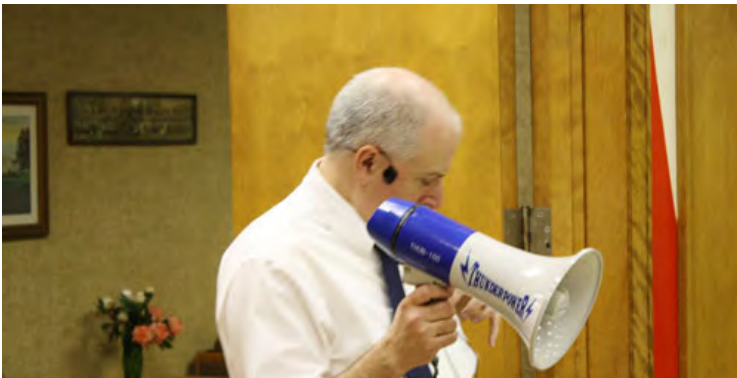
The FBI Negotiator is ready to free the hostages